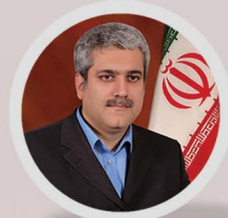
Dr. Sorena Sattari Vice-President for Science and technology